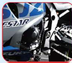
Bi-Directional Quick Shift System