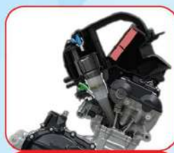
Ride by Wire Throttle Bodies