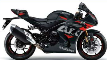
Metallic Mat Black No.2 (4TX)