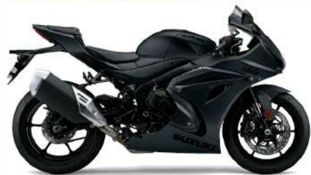
Metallic Mat Black No.2 (YKV)