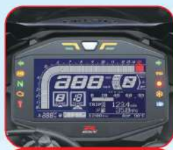
Full LCD instrument cluster