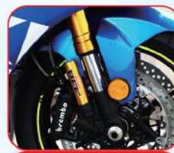
Proven Showa Suspension