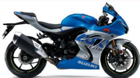
Metallic Triton Blue / Metallic Mystic Silver (GUL)