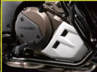
Aluminum under cowling