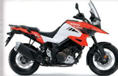
Pearl Brilliant White / Glass Blaze Orange (B1F)