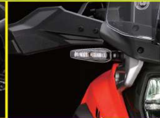
LED turn signal