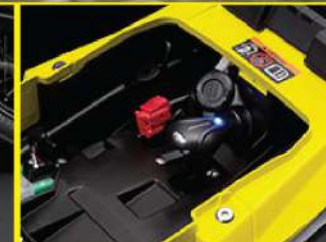
12V DC socket