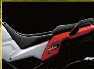
Seat (height adjustable)