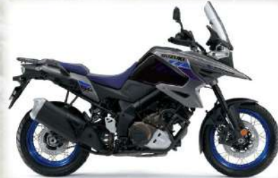
Metallic Oort Gray No.3 / Glass Sparkle Black (BD7)