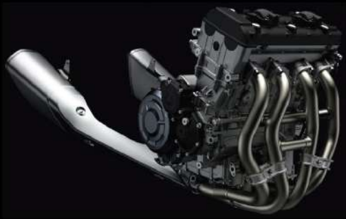
Legendary power and reliability Hayabusa's legendary 1,340cm 3 liquid-cooled inline-four engine achieve an even better balance of overall performance.