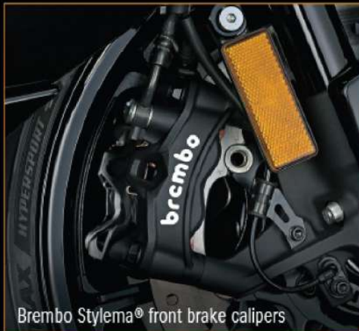
Brembo Stylema® front brake calipers