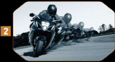
2 Ant-lift Control System Advanced system that maximizes acceleration performance while preventing the front wheel from lifting off the ground.