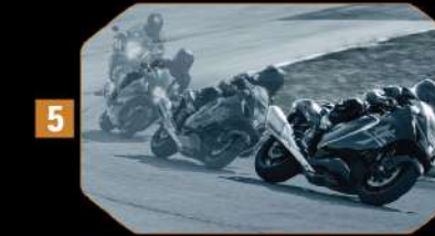
5 Motion Track Traction Control System This takes traction control to a new level by employing data from the IMU to constantly monitor the amount of lean angle and effectively limit slip in corners as well as on straightaways.