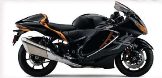
Glass Sparkle Black / Candy Burnt Gold (B5L)