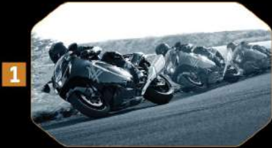
1 Power Mode Selector Three different engine output modes that control power delivery to match road and riding conditions.