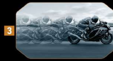
3 Bi-directional Quick Shift System Shift up or down more quickly and easily without the need to operate the clutch or throttle. Quick Shift offers two modes.