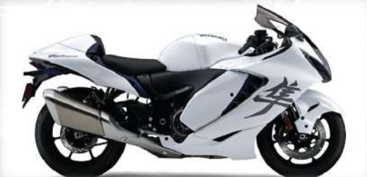
Pearl Brilliant White / Metallic Matte Stellar Blue (B5N)