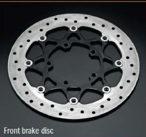
Front brake disc