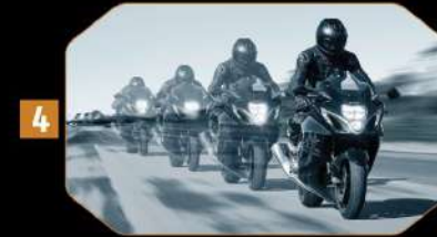
4 Engine Brake Control system This system cancels out the effect of engine braking to suppress rear tire sliding or skipping and provide smoother, more controllable behavior.