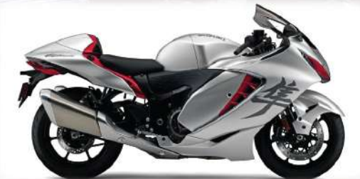
Metallic Matte Sword Silver / Candy Daring Red (B5M)