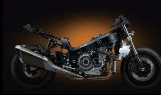
Superior core strength The Hayabusa's chassis is designed to empower you with sure footing, nimble handling and predictable control that combine to build confidence and enhance the riding experience.