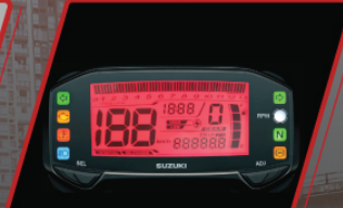
New Multi-Functional Full Digital Meter.