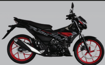
Titan Black (40X)