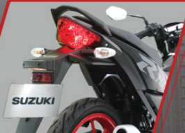
Tail Light and LED License Plate Light