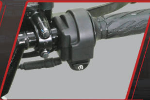
Suzuki Easy Start System