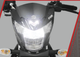
New Aggressive Led Headlamp