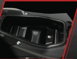
New Storage Space