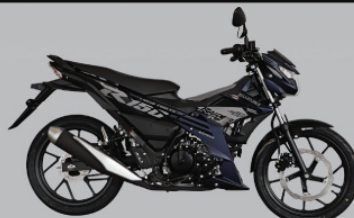
Metallic Matte Stellar Blue / Titan Black (CHT)