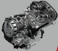
4-STROKE, DOHC, 4-VALVE, 6-SPEED