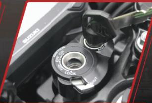
New Shutter Key System