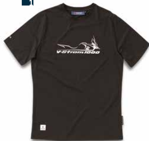
1 | V-STROM 1000 T-SHIRT Black T-Shirt in V-Strom 1000 design with white print, 100% Cotton. Available sizes: S-3XL 990F0-DLTS2-size