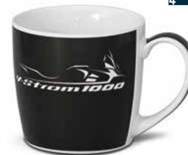
4 | V-STROM 1000 MUG Black/white design with V-Strom 1000 logo, ceramic, suitable for microwave and dishwasher. 990F0-DLMG1-000