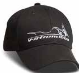
2 | V-STROM 1000 CAP Black cap with embroidered logo, 100% Cotton. One size fits all 990F0-DLCP1-000