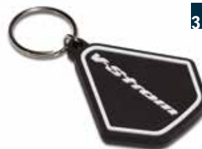
3 | V-STROM 1000 KEY RING Black/white, PVC 990F0-DLKE1-KEY