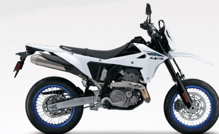
Solid Special White No.2 (30H)