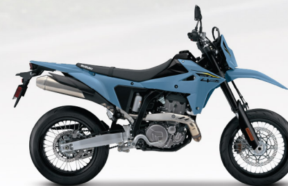
Sky Gray (Q1T)