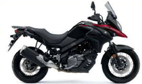
Candy Daring Red / Glass Sparkle Black (AV4)