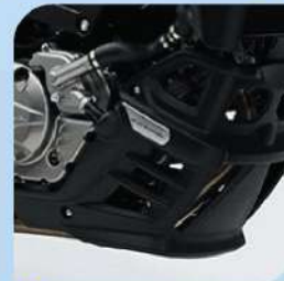
Engine under cowling