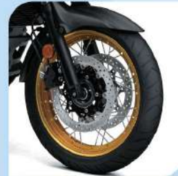
Wire spoke wheels with tubeless tire