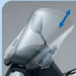
Three-way adjustable wind-screen