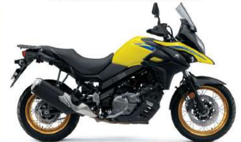
Champion Yellow No.2 (YU1)