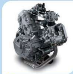
Dual Spark 90° V-Twin Performance