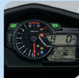
Analog Tachometer & Digital Speedometer